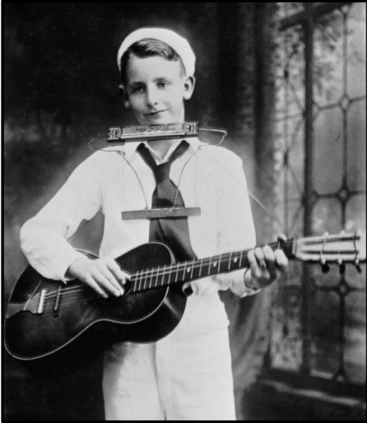
Lester Polsfuss, performed as Red Hot Red before he left Waukesha